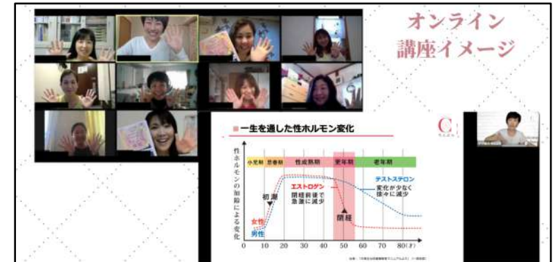
Online Seminar image